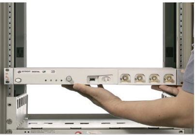
Make the most of your rack space with an Keysight 6000L Series oscilloscope.