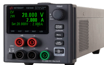
Recessed Binding Posts

Connect for computer control with standard LXI/LAN and USB connectivity. Use the security slot to keep the power supply on your bench.