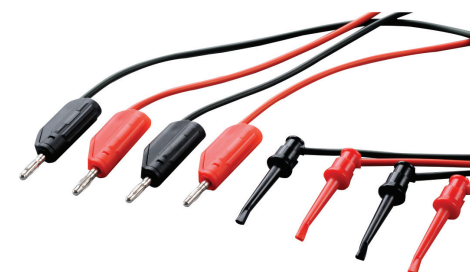
Optional test lead kit